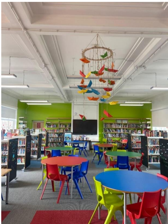
Paper boats mobile display in the library – boats contain messages of love, courage and hope for a safe journey from KS3 students to refugees