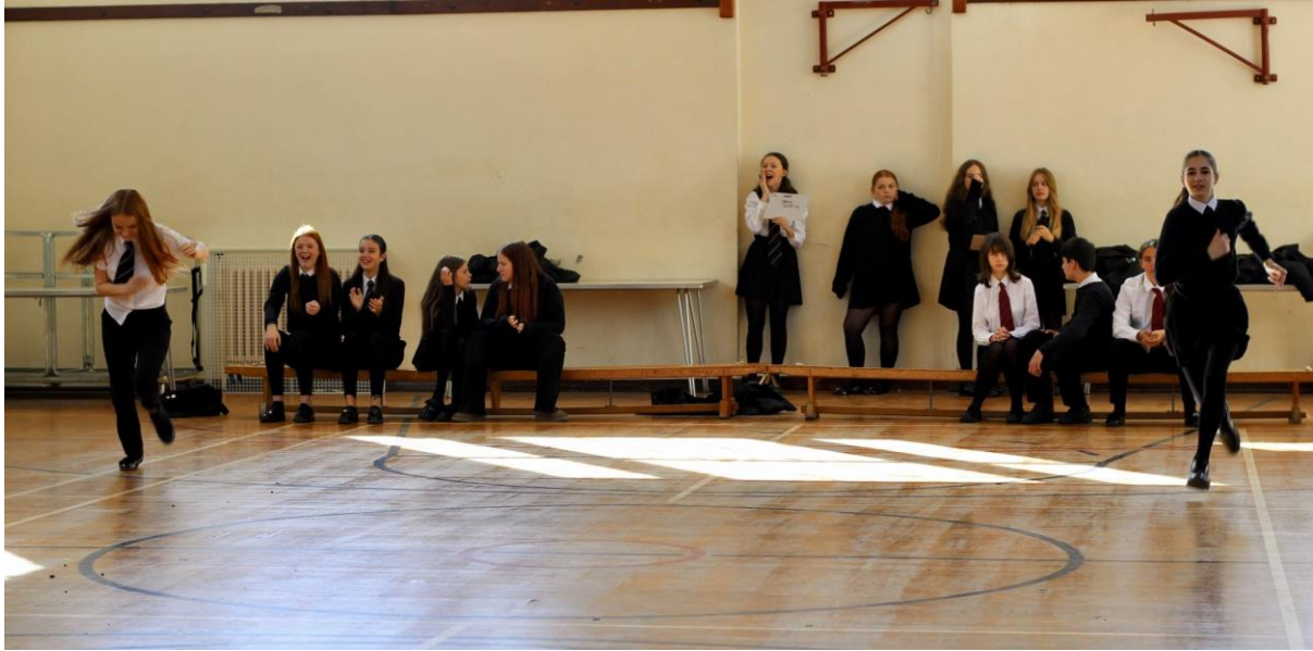
Year 10 art workshop on the theme of "identity"