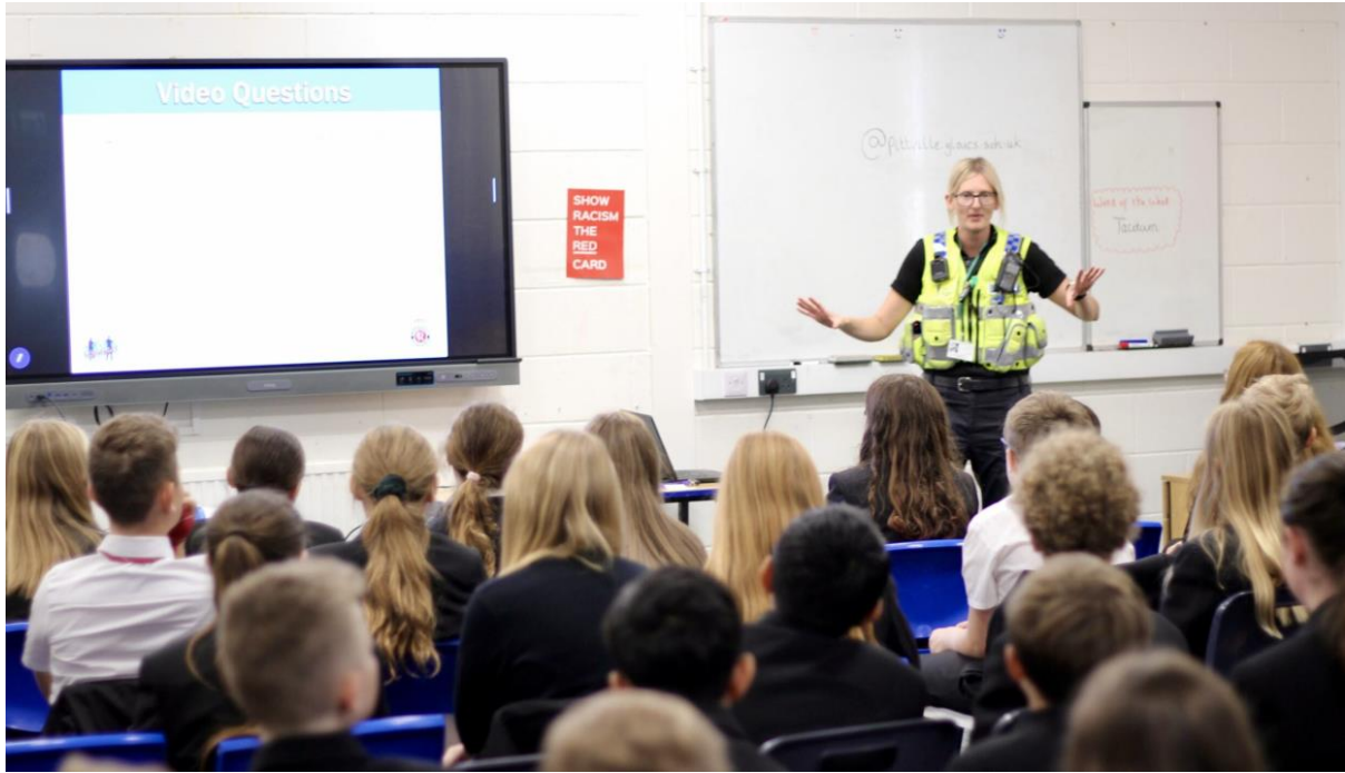
Year 8 Performance of “crashing”, a play about child criminal exploitation.